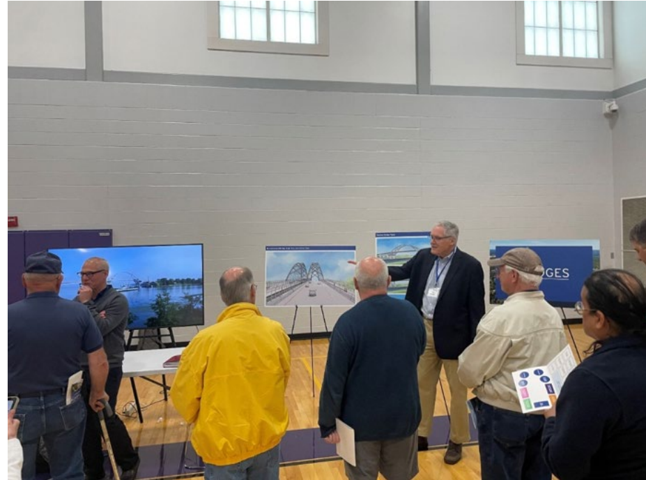
Cape Cod Bridges Open House