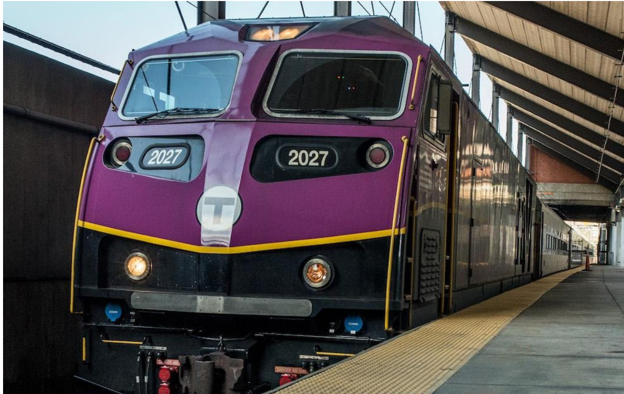
MBTA Commuter Rail