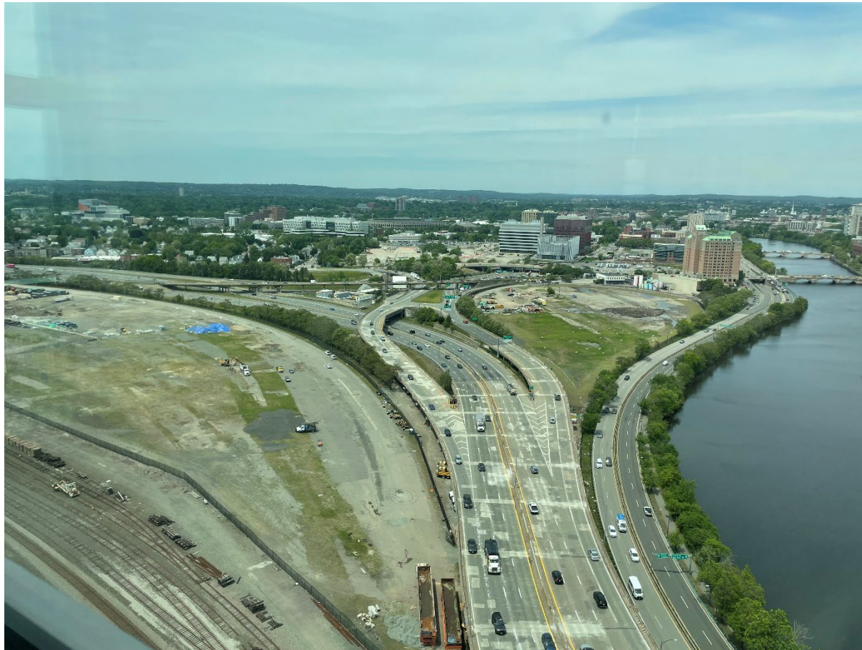
Beacon Park Yard