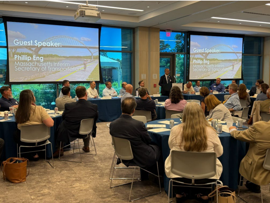
Cape & Islands Bridges Coalition Quarterly Meeting June 9, 2026