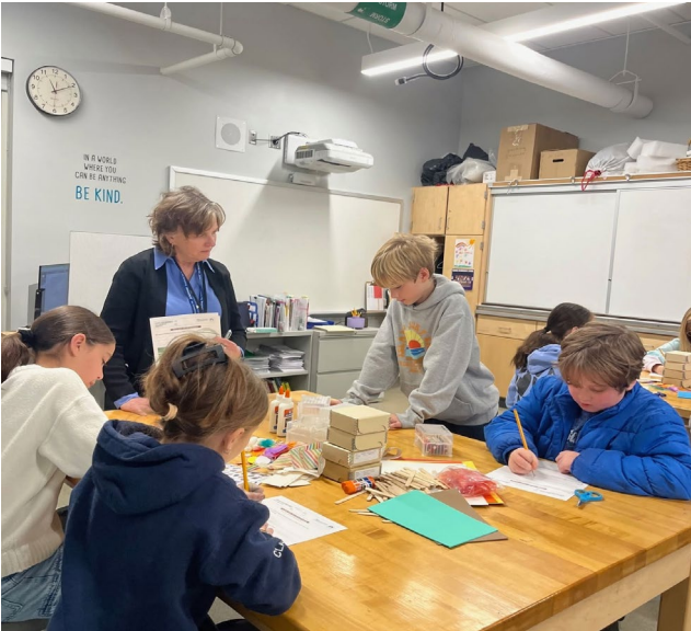
Bourne Public School students learn about Cape Cod Bridges

Engaging the diverse communities across the region