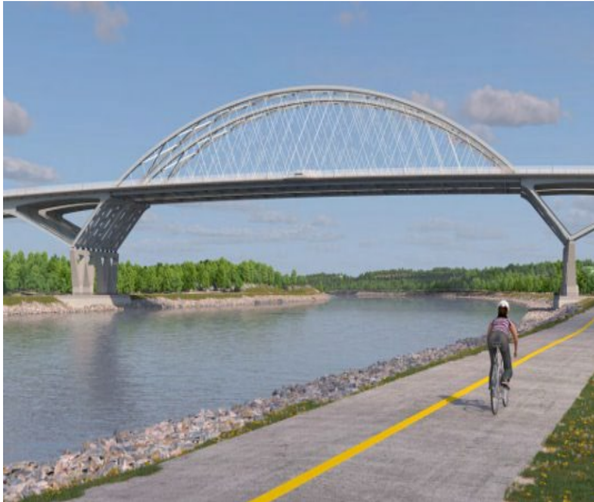
Rendering of preferred bridge type

Phase 1 advances permitting, design and field activities