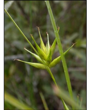
Michaux's Sedge is a wetland species that has long, slender perigynia that taper gradually to a toothed beak.