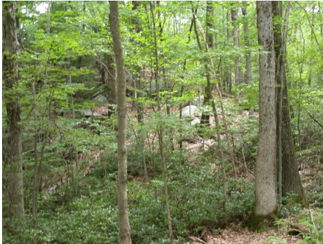
Across a slope with Mixed Oak over mountain laurel.

Description: Mixed Oak Forest/Woodland is a deciduous forest or woodland community dominated by multiple species of tree oak that occurs on dry soils and exposed acidic talus or rocky slopes. The canopy may be closed or somewhat open (typically having ~70% cover) at ~20m (~60 ft.). More mature forest examples tend to have denser canopy cover. Trees in many examples are small - young or stunted with broken tops - with diameters 6-8", and only occasional larger trees >10" diameter. The tall shrub layer may be patchy, over an often extensive lower shrub layer. The herbaceous cover is variable. Undecomposed oak leaves cover the ground.