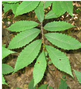
American chestnut, often in Mixed Oak as a shrub.

saplings of canopy species with (depending on location) gray birch, striped maple, witch hazel, shadbush, and chestnut is dense in patches. The shrub layer may be extensive or at least also dense in patches with lowbush blueberries, huckleberry, and/or mountain laurel. A scattered herbaceous layer is often primarily wild sarsaparilla and Pennsylvania sedge.