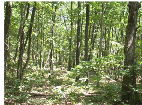
Mixed Oaks with red maple.

Examples with Public Access: Mt. Tekoa WMA, Russell; Minute Man NHP, Lexington; Douglas SF, Douglas; Palmer WMA, Palmer.