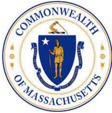
Commonwealth of Massachusetts