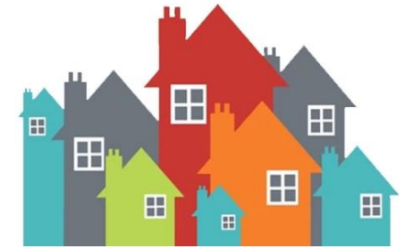
Division of Public Housing