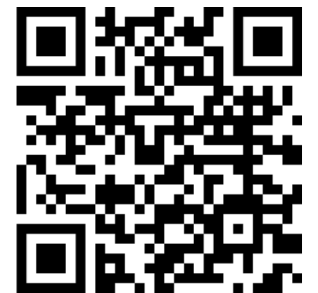
Study Website QR Code

https://www.mass.gov/k-circle-morrissey-study or QR Code: