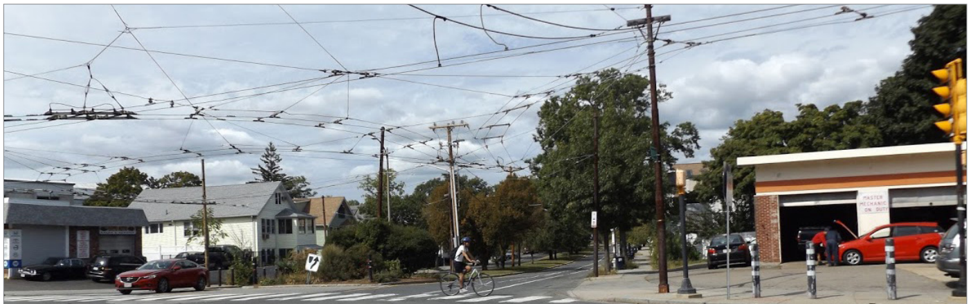
With an eye toward the desired improvements for buses 71 and 73, the catenary wires which power these buses were discussed during the site walk. This discussion was continued as the short-term design alternative moved forward over the course of 2017.

A main topic of discussion was the significant delay faced by inbound buses in the morning peak hours. Elected officials reported complaints of buses being caught in traffic on this 3,500-foot stretch of Mount Auburn Street for well over 10 minutes. Buses were also described as overcrowded, and passing by people waiting for the bus in the morning—making the service less reliable for local residents as a commuting choice.