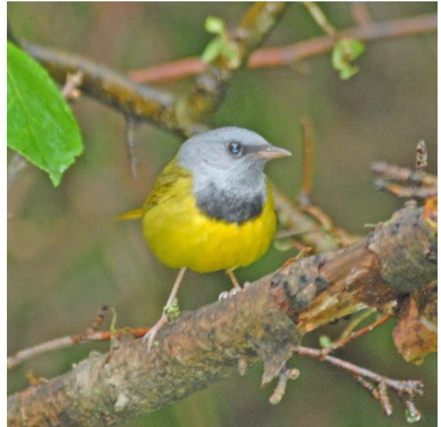
Mourning Warbler showing the black bib above the bright yellow underside.

DESCRIPTION: A rather secretive species, the Mourning Warbler is often difficult to observe, except when the male is singing from a perch. The back, wings, and tail are olive green, while the underside is mostly bright yellow, grading to yellow-olive on the sides. The head and throat are gray, forming a bib on the upper chest. The lower edge of the bib grades to black in males. Legs are flesh-colored to pinkish. This combination of features sets it apart from all other genera of wood warbler. The Mourning Warbler is a relatively small warbler, with an overall length of 5.25 inches and a wing span of 7.5 inches. Its song is repetitive and rhythmic with a rich, burry quality. The first part of the song is a single syllable repeated 3 to 7 times, followed by a lower syllable often repeated twice. The entire song is described as “churry, churry, churry, churry, chorry, chorry”. A special flight song is also given during the latter part of the nesting period, beginning with a series of chip notes as the male flies upward into the sky.