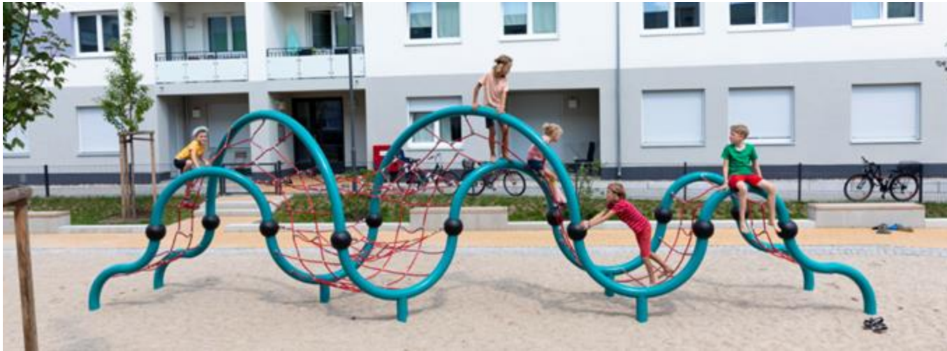
Twist Net Climber