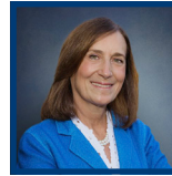
A Message from the Office of State Treasurer Deborah B. Goldberg

To request a workshop near you, email us at empowerment@tre.state.ma.us .