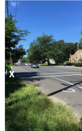
Figure 4 - Incident location. X marks victim's assigned location.