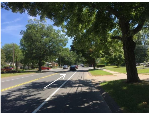
Figure 5 – Roadway leading up to the intersection. Note that there is no signage warning motorists of the crosswalk ahead.

The crossing guard was wearing the town provided ANSI Class 2 compliant high-visibility vest and was using the provided stop paddle. Two students walked up to the victim at the intersection in a northeast direction along the side street and needed to cross the main road. The crossing guard had the students stay on the sidewalk and then with the STOP paddle raised she stepped off the sidewalk and entered the roadway at the crosswalk location (Figure 6). She had walked in the crosswalk out to the middle of the travel lane closest to her, when she was struck by a motor vehicle traveling on the main road in a southeasterly direction. The victim landed in the roadway and the motorist stopped the car and stayed at the incident location.