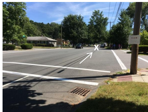
Figure 6 – Incident location. X marks victim location and the arrow indicates vehicle travel direction.