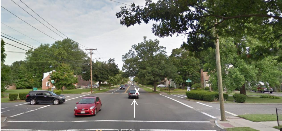
Figure 3 - Incident location. X marks victim location and the arrow indicates vehicle travel direction.