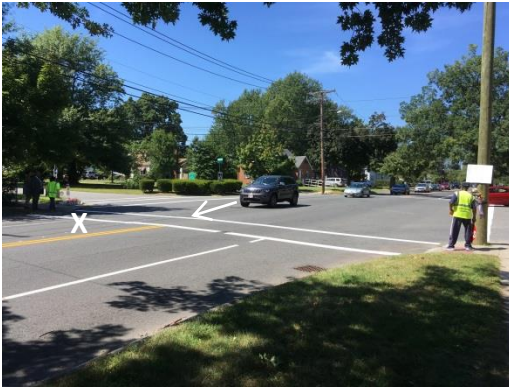
Figure 1 – Incident location. X marks victim location and the arrow indicates direction of travel of the vehicle.

The city provided the crossing guards with personal protective equipment (PPE) that included a stop paddle and an American National Standards Institute (ANSI) Class 2 compliant, high-visibility vest. The school department requires the use of these two pieces of PPE. If crossing guards wanted additional PPE, they had the option of purchasing items through the city contract. Crossing guards are provided with a new ANSI Class 2 vest annually and the stop paddles had to be inspected by the crossing guard supervisor to determine if it needed to be replaced.