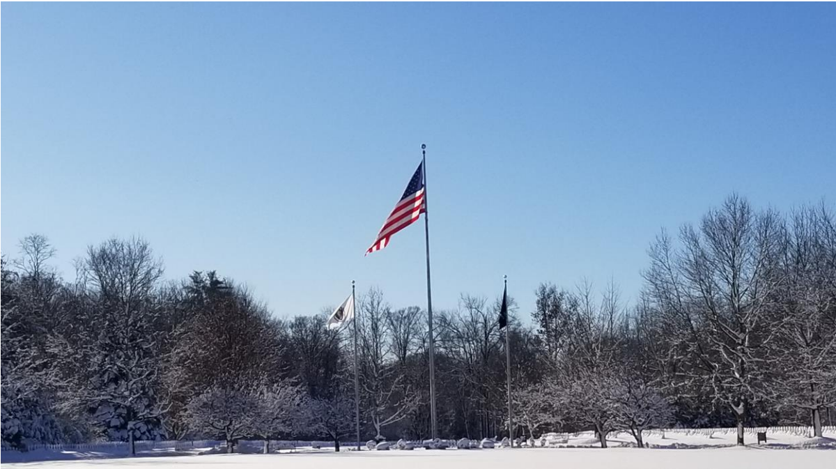
MVMC Agawam American, Commonwealth, and POW/MIA flags after January 2024 snowstorm

March 29: Vietnam Veterans Day or Welcome Home Vietnam Veterans Day https://pva.org/news-and-media-center/recent-news/welcome-home-vietnam-veterans-day-faq/