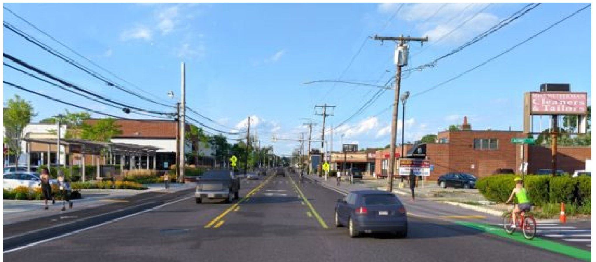
Rendering of improvements to Needham Street in Newton