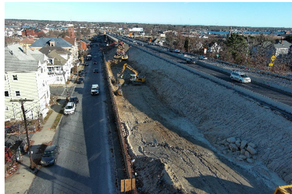
Image 4. Excavation along Ramp A