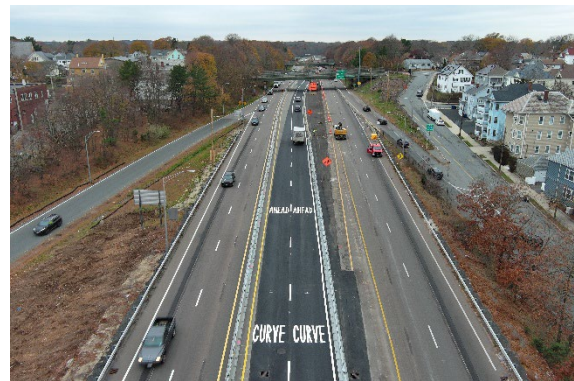
Image 2. Shift to Phase 2 Traffic