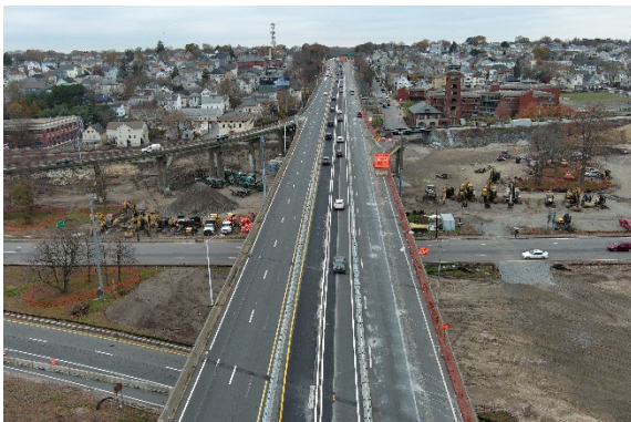
Image 1. Completion of Phase 1