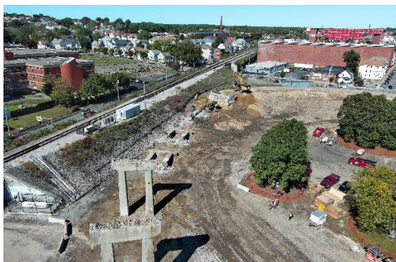
Image 3. Ramp C Demolition