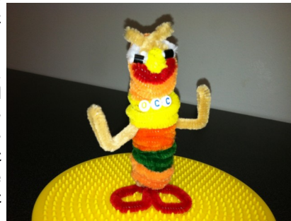
The "OCC Mascot" was crafted by Brockton CCC ISL III/IV participants learning about stress.

"Activities like going for a walk or doing arts and crafts buy time for a person to deescalate the overwhelming emotions that come with stress. I've found that this project works well to teach participants to turn to something other than drugs to deal with stress," said DaVeiga. Participants crafted objects out of different items including construction paper, cardboard and clay. Objects ranged from cartoon characters to ornaments. One participant even crafted the "OCC Mascot" out of pipe cleaners.