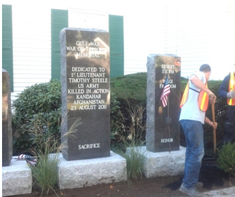
Community services workers grade soil at the newly installed War on Terrorism Monument at Post 223 in Duxbury.

In August the Trial Court Community Service Program (CSP) completed work on a new memorial at the American Legion Post 223 in Duxbury.