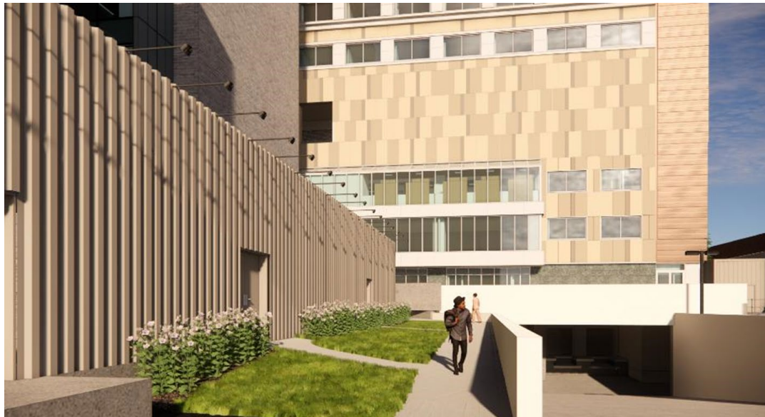
Equipment yard enclosure