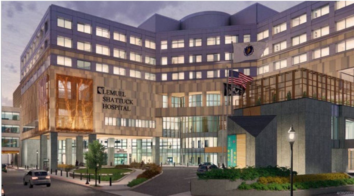
Shattuck Hospital from street view