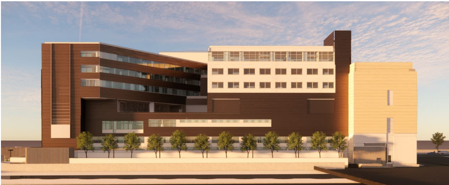
New Shattuck Hospital Façade