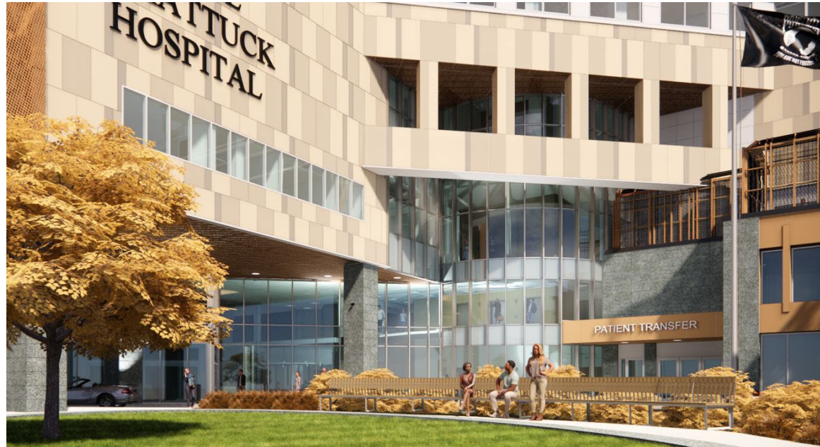
Shattuck Hospital from lawn