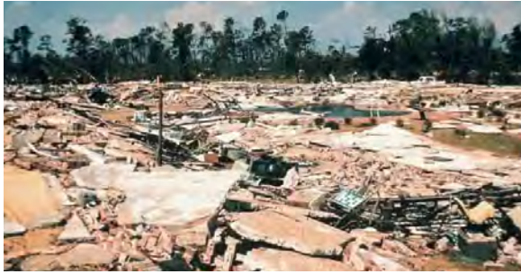
The aftermath of Hurricane Camille.

1964: Great Alaska Earthquake and Tsunami 1965: Flood Control Act of 1965 (P.L. 89-298) 1965: Hurricane Betsy and the Southeast Hurricane Disaster Relief Act (P.L. 89-339) 1966: The Disaster Relief Act of 1966 (P.L. 89-769) 1968: National Flood Insurance Program Hurricane Camille 1969: First NFIP Communities