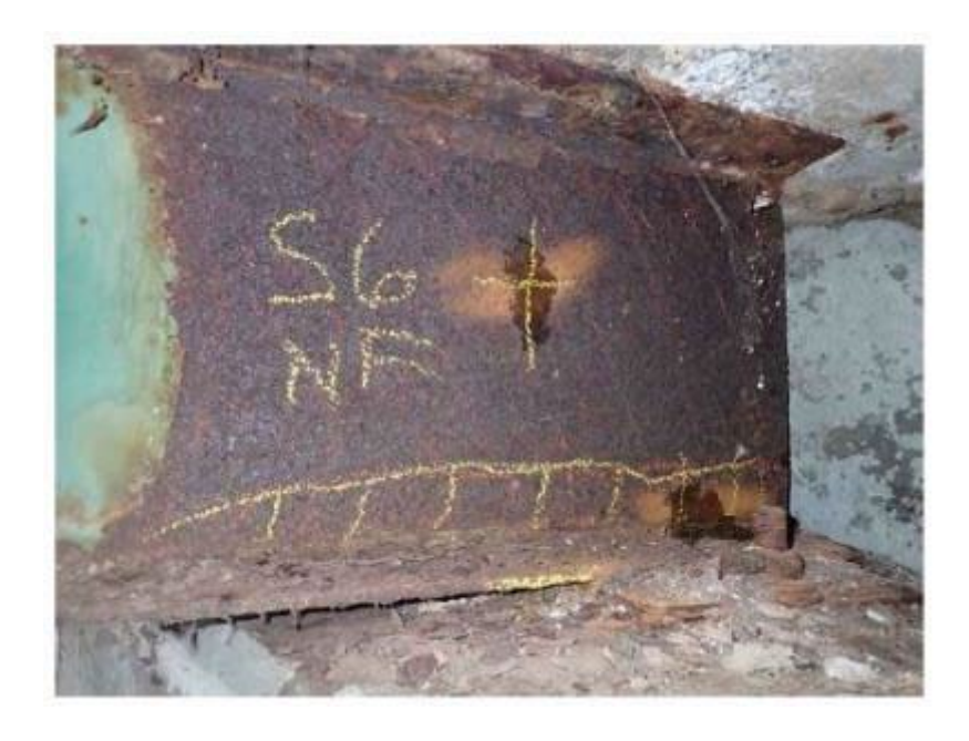
Section loss in truss stringer