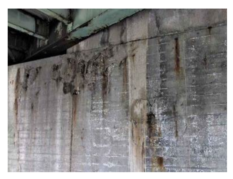
Spalling at West Abutment