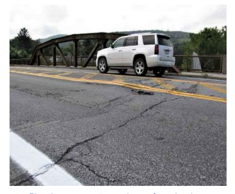
Bituminous concrete wearing surface showing signs of cracking and spalling