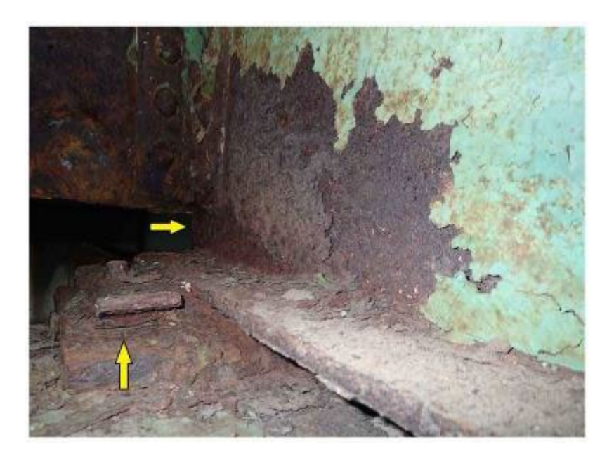
Web buckling and pack rust around the bearings