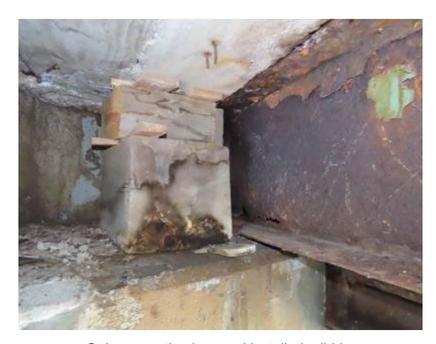
Stringer section loss and installed cribbing