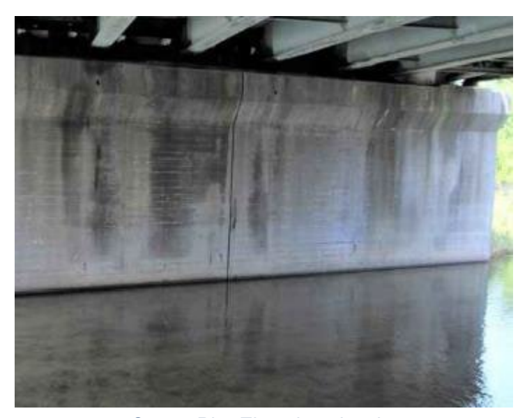
Center Pier Elevation showing satisfactory condition