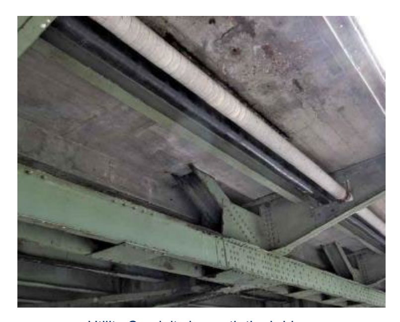
Utility Conduits beneath the bridge