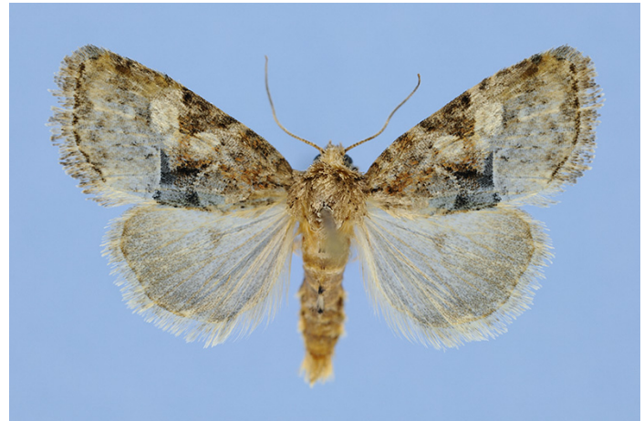
Neoligia semicana ▪ Specimen from MA: Nantucket Co., Nantucket, collected 5 Jul 2005 by M. Mello

DESCRIPTION: The Northern Brocade Moth ( Neoligia semicana ) is a noctuid moth with a wingspan of 18-21 mm (Forbes 1954, MPG 2015). The forewing has a grayish-brown to grayish-green ground color, paler distal to the postmedial line, with dark patches at the outer margin and near the apex. The median area is shaded with brown toward the costal margin, and with a dark brown to black bar toward the inner margin. The postmedial and antemedial lines are white and smoothly curved. Both the reniform and orbicular spots are relatively large and cream-colored, though the orbicular spot may be obscure in some individuals. The hind wing is uniformly tan, with a faint discal spot. The head and thorax are concolorous with the forewing ground color, and the abdomen is tan with black-tipped tufts of elongated, dorsal setae on segments three and four. Two similar congeneric species occur in Massachusetts, Neoligia atlantica and Neoligia subjuncta ; the former tends to have a more distinct black bar between the postmedial and antemedial lines, and the forewing of the latter tends to be more brown than grayish-brown to grayish-green (Troubridge & Lafontaine 2002). However, the wing patterns of N. semicana , N. atlantica , and N. subjuncta are so similar that genitalic dissection may be necessary for definitive identification.