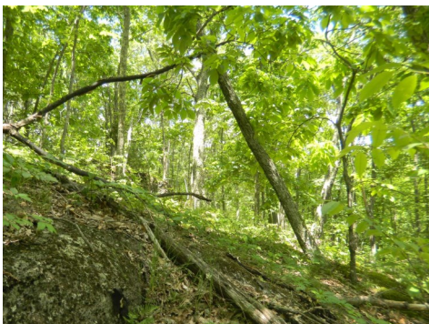
Rocky slope with Oak - Hickory Forest.

Description: Oak - Hickory Forest is a somewhat enriched hardwood forest dominated by a mixture of oaks with hickories mixed in at a lower density. They occur on well drained sites, such as ridgetops or slopes, often with SW, S, or SE aspects. The canopy is closed to interrupted (>50% cover), the shrub layer diverse with dense patches, and the herbaceous layer diverse but scattered. The duff layer may be deep with undecomposed oak leaves. Many occurrences are rocky. The forest may include small patches of rock outcrop or Hickory - Hop Hornbeam Forest/Woodland, and may itself be surrounded by White Pine - Oak or Oak - Hemlock - White Pine Forests.