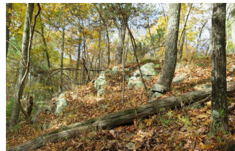
Rocky hill in Oak - Hickory Forest.

Boxford WS (DFW), Boxford; Wachusett Meadow WS (MAS), Princeton; Camels Hump, Petersham; Palmer WMA, Palmer; Moose Hill WS, Sharon.