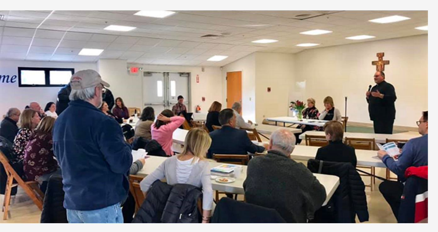
Participants gather to attend a suicide and problem gambling training session