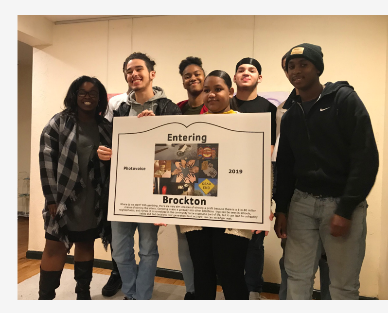
Photovoice participants provide outreach in the community.

The Photovoice Project aims to prevent or reduce the occurrence of underage gambling among youth and problem gambling among all age groups. Photovoice is intended to enhance the power of community members to become catalysts of change. Youth participants receive extensive training and use photography to visually document the issues facing their community and to develop prevention-focused messaging. Youth sign up for the Photovoice program through local community centers (i.e.,YMCA), and through peer-to-peer activities, the program aims to increase awareness of gambling exposure in the everyday lives of youth, their caregivers and in their communities.