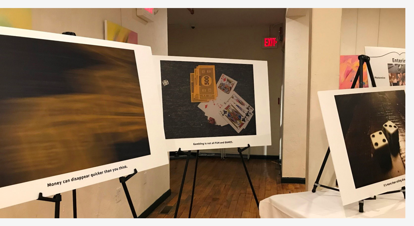
Photovoice projects are proudly on display in the community.

Community members exposed to UG and PG prevention messaging.