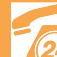
24-hr Phone Access To Medical Staff