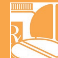
Prescription & OTC Drugs