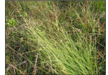
Papillose Nut-sedge fruiting culm, with white achene covered with warty projections (left), and characteristic cespitose (clumped) growth form (right).

AIDS TO IDENTIFICATION: Technical manuals should be consulted to distinguish nut-sedge species. Papillose Nut-sedge is characterized by: