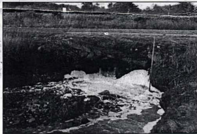
At the same spot before work began, right, shows how the flow was restricted, causing the water on the other side of the road to turn brackish.

Results from samples collected are used to help determine if the restoration has been successful and what project modifications may be needed.