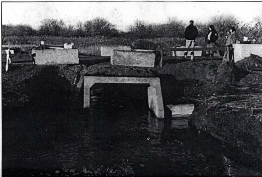
The newly restored culvert beneath Argilla Road in Ipswich, above, allows the free flow of nutrient-rich saltwater in the marsh there.

This type of monitoring is an essential component of any well-designed restoration project.