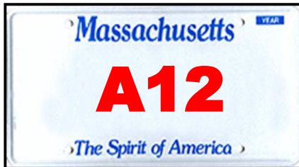
One Letter, Two Numbers