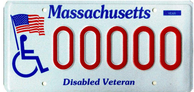
New Design of Disabled Veterans Plate issued 2005