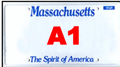
One Letter, One Number