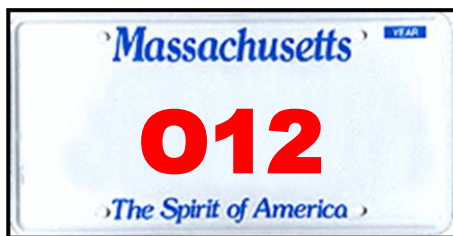
The Letter "O", Two Numbers No Longer Issued