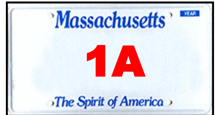
One Number, One Letter