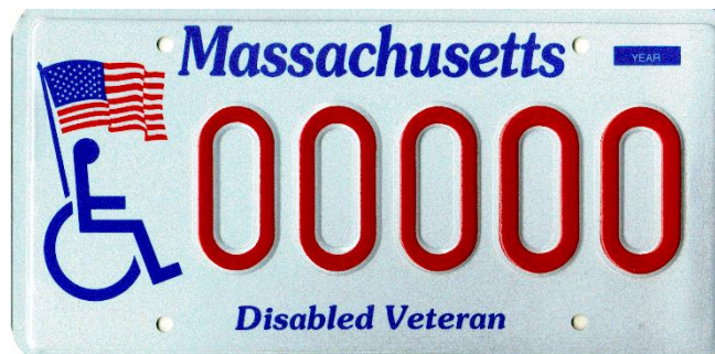
New Design of Disabled Veterans Plate issued 2005