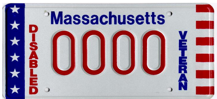
Older Design of Disabled Veterans Plate issued prior to 2005