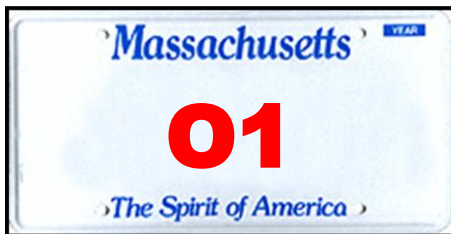
The Letter "O", One Number No Longer Issued