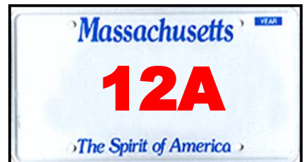
Two Numbers, One Letter