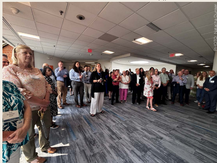
We had a full house, including board and staff from several retirement boards, join us to celebrate the dedication of our new space.