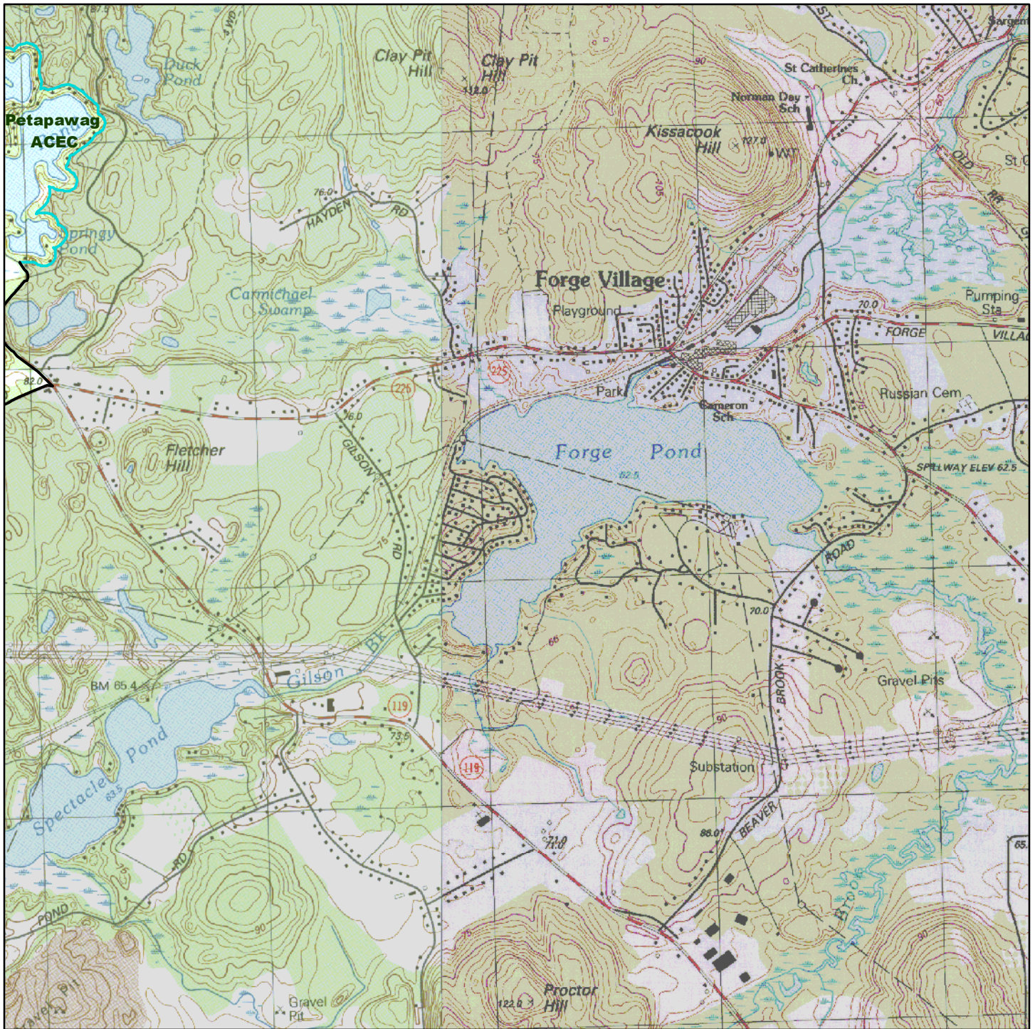
Map # 181 Petapawag ACEC Map Tile 12 of 12 ACEC Designated 12/11/02 25,680 Acres