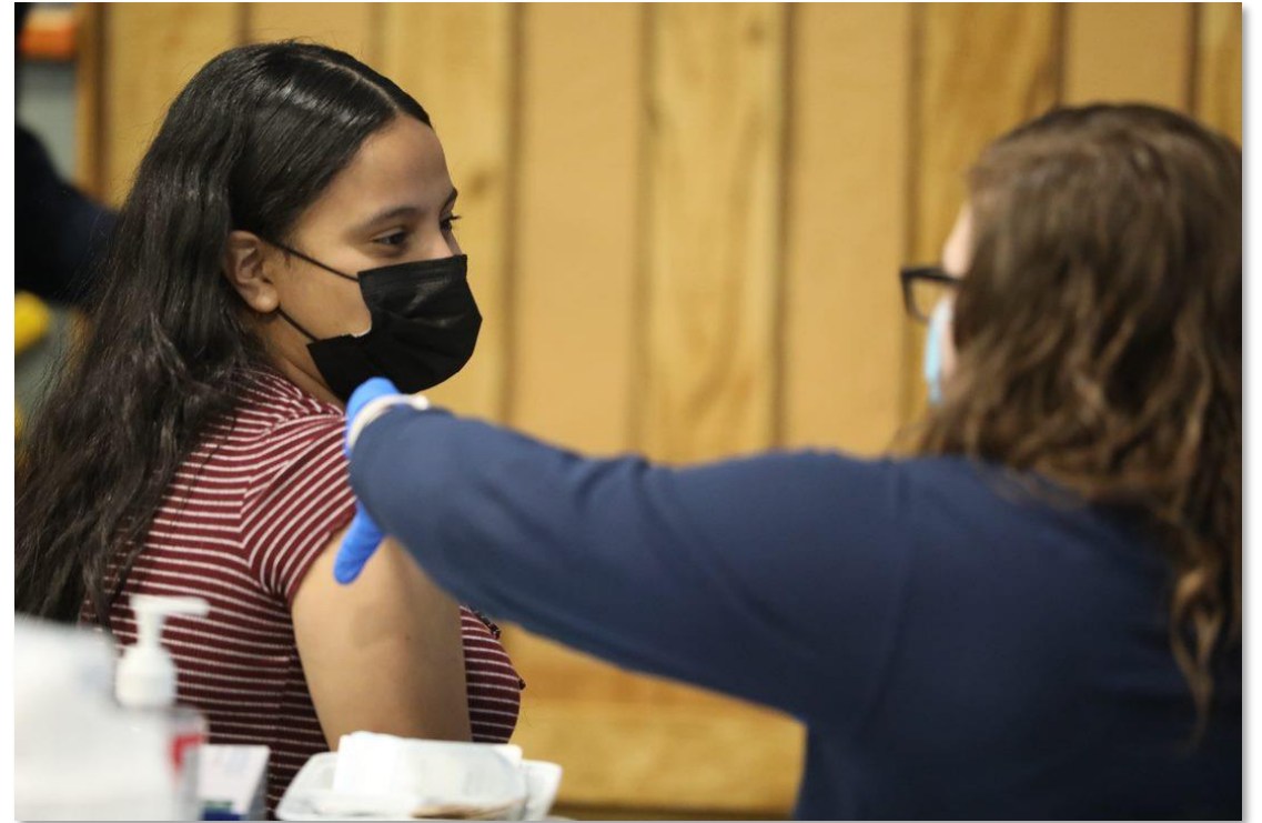
A vaccination clinic in Chelsea during school vacation week