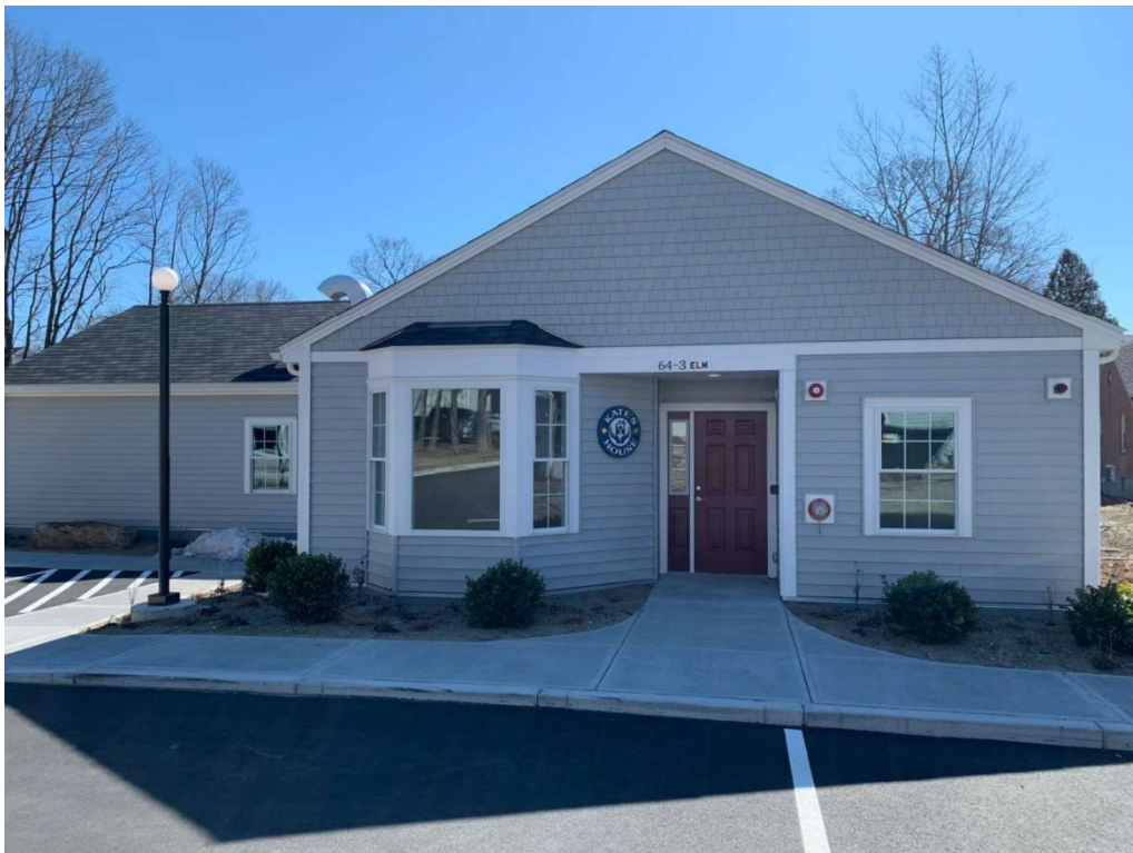
Trettis House, Cohasset Housing Authority