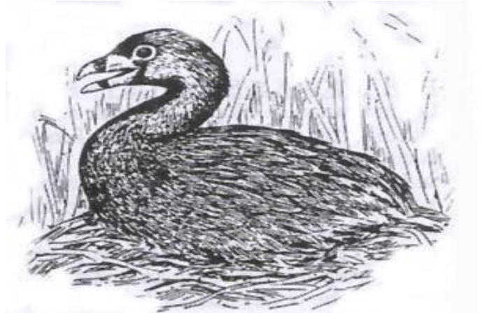
Charles Joslin, from DeGraaf, R., and Rudis, D. New England Wildlife, 1983.

BEHAVIOR/LIFE-HISTORY: Pied-billed Grebes arrive in Massachusetts in late March and begin courtship displays, which consist of diving and chasing, bill touching, circling, and calling; this may continue until June, but nesting is usually initiated in late April. The nest is constructed over a period of 3 to 7 days by both the male and female out of decayed reeds, sedges,