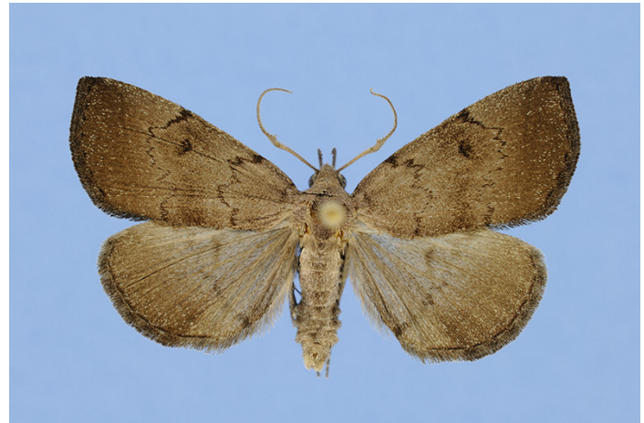
Zanclognatha martha ▪ Specimen from MA: Plymouth Co., Plymouth, adult female collected 4 Aug 2004 by M.W. Nelson, reared from egg, adult emerged 12 Jul 2005

DESCRIPTION: The Pine Barrens Zanclognatha ( Zanclognatha martha ) is an erebid moth with a wingspan of 25-30 mm (Forbes 1954). The forewing is dark brown, paler proximally (in the basal area) and darker distally (in the terminal area); the postmedial and antemedial lines are very dark brown, almost black, jagged and narrow, but wider toward the costal margin. The reniform spot is a small dot, concolorous with the postmedial and antemedial lines. The hind wing is brown, paler than the forewing on average, but darker towards the outer margin; a darker brown, but faint postmedial line and discal spot are present. The head and thorax are concolorous with the proximal portion of the forewing, and the abdomen is concolorous with the hind wing. Subterminal lines of the forewing and hind wing, when present, are faint, and considerably obscured as compared to the similar Zanclognatha protumnusalis .