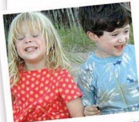
VACATIONING ON PLUM ISLAND