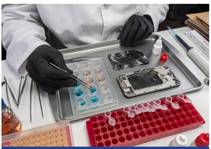
HSP45 Laboratory Supplies and Equipment