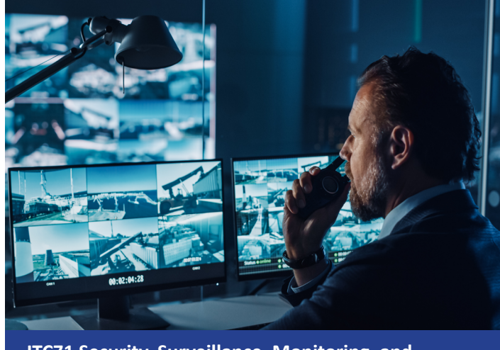
ITC71 Security, Surveillance, Monitoring, and Access Control Systems