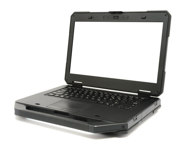
ITC73 IT Hardware and Services