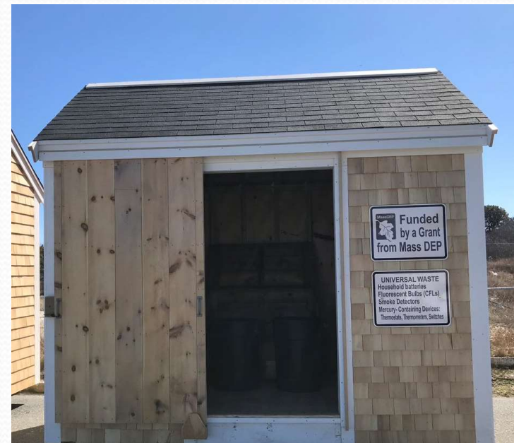
Universal Waste shed in Nantucket (Muni20)