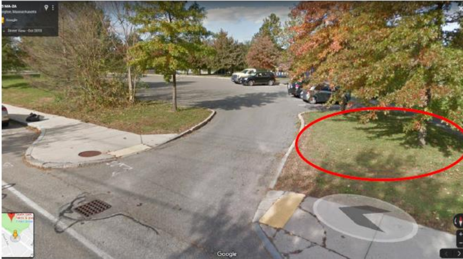
McClennen Park, near parking lot