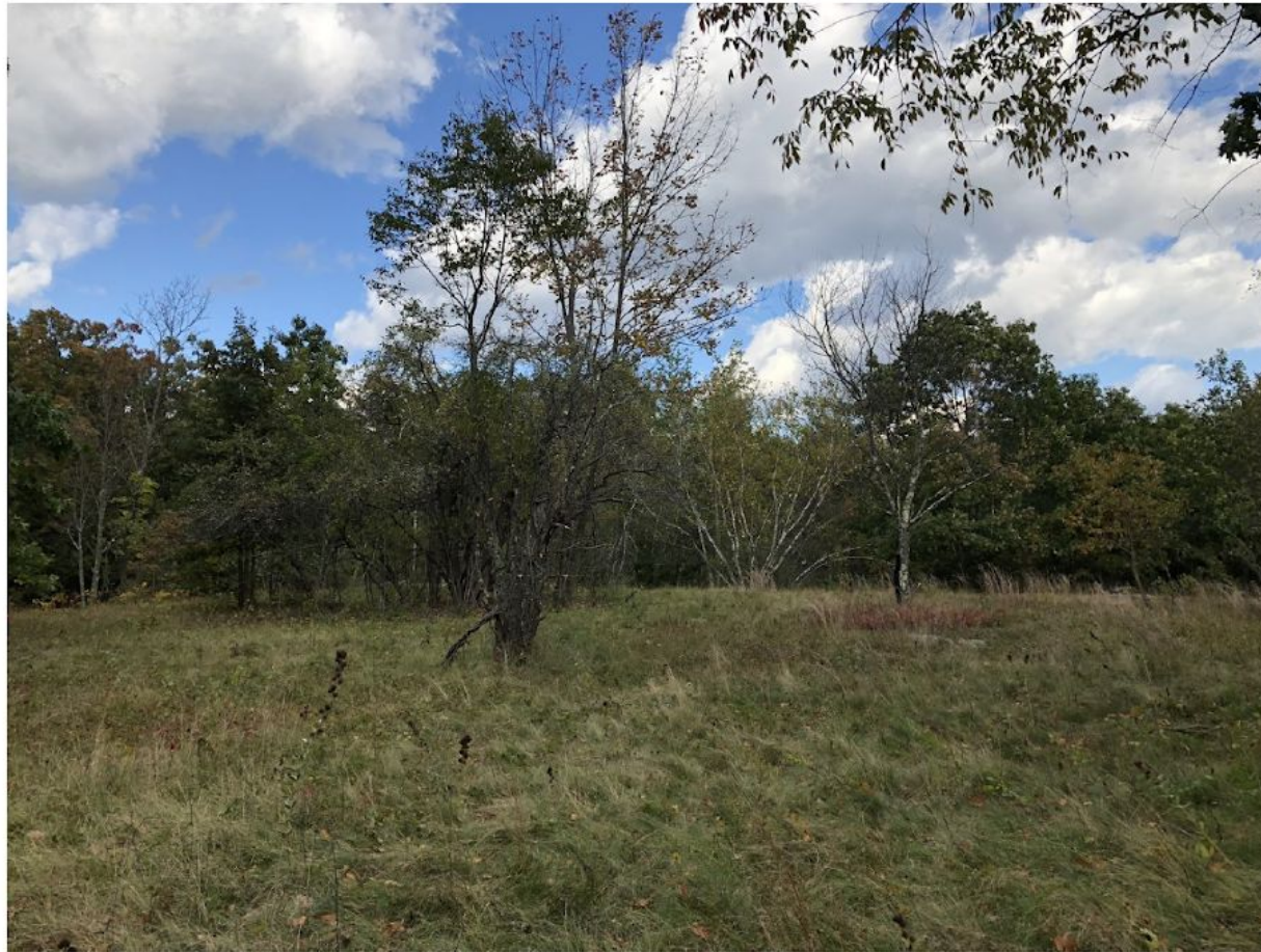
The so-called 90mm site in the Medford section of the Middlesex Fells Reservation.