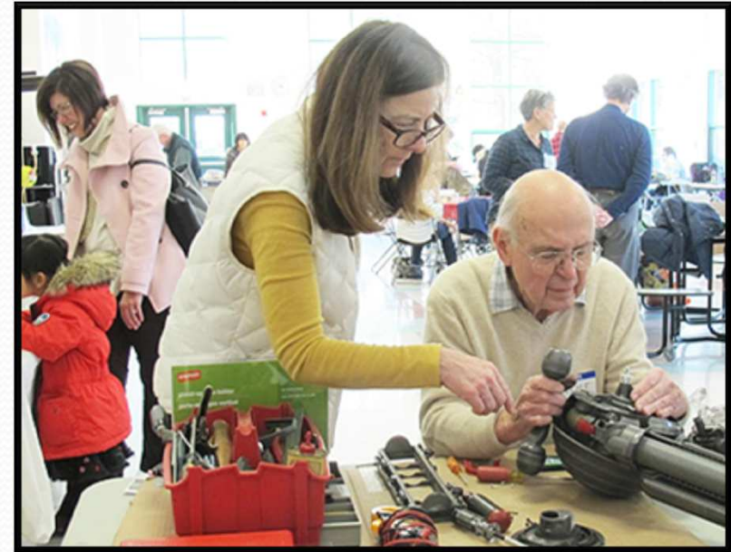
Repair Café in Bolton.