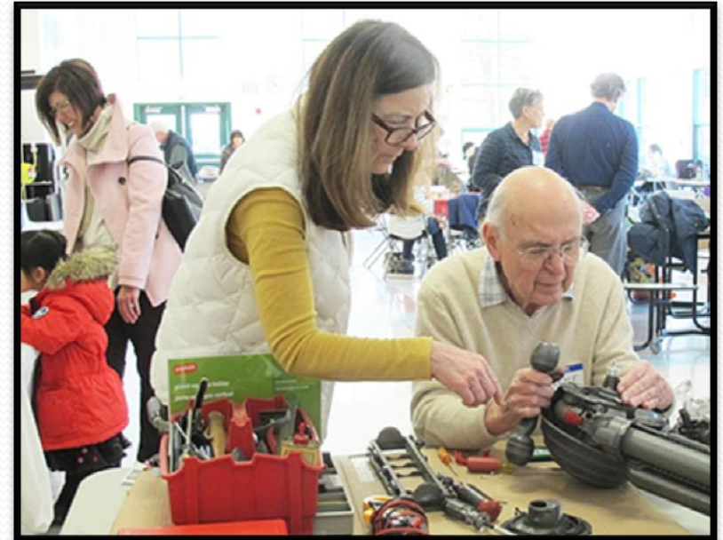
Repair Café in Bolton.