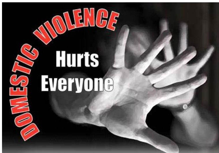
Graphic Illustration by Dawn Pandoliano

October is Domestic Violence Prevention Month.