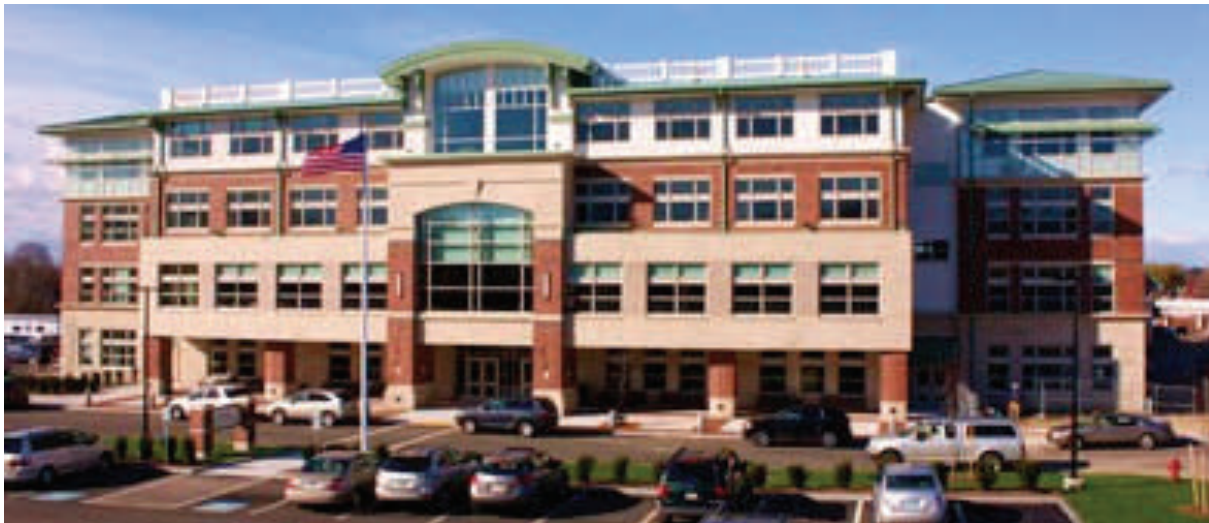
Beverly High School—2012