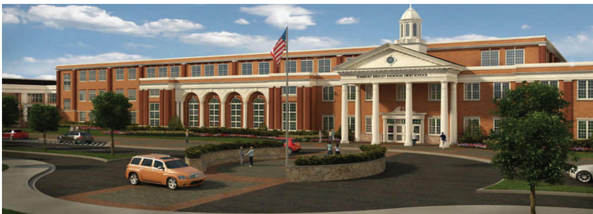
Norwood High School—2012