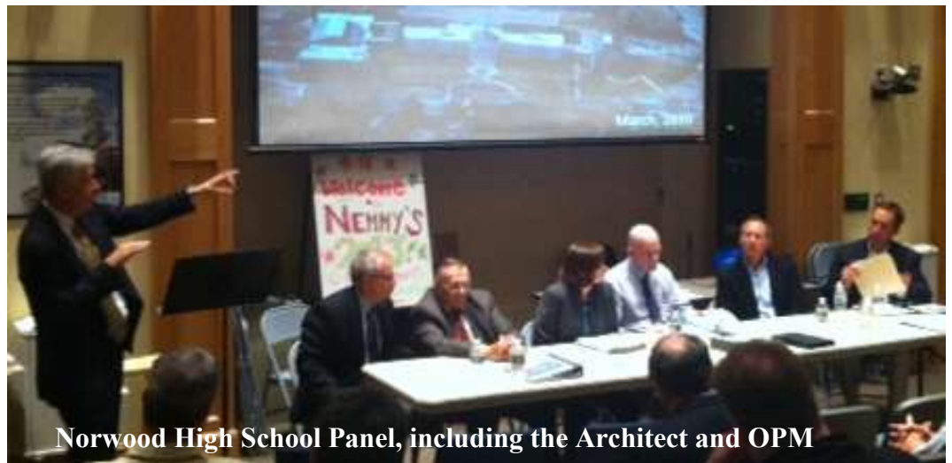
Norwood High School Panel, including the Architect and OPM