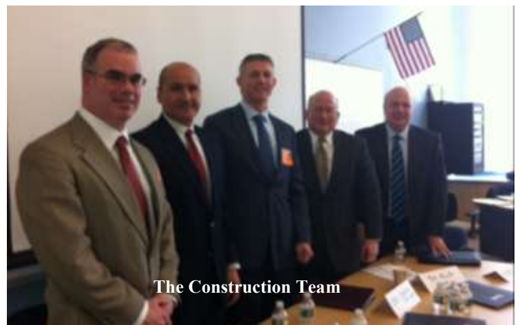
The Construction Team