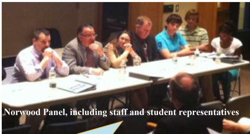
Norwood Panel, including staff and student representatives