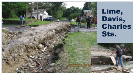
Lime, Davis, Charles Sts.

MVP Grant: $56,250 Match Amount: $18,750 Total Project Cost: $75,000