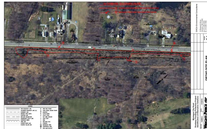
Analysis of existing flood conditions along Montague City Road