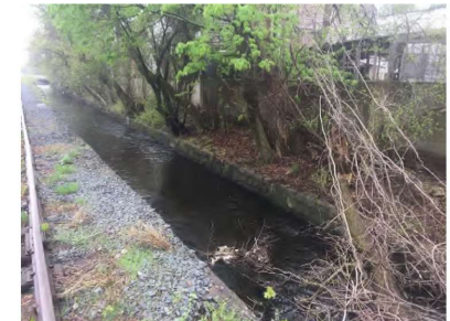
Photo of Existing North Canal Wall