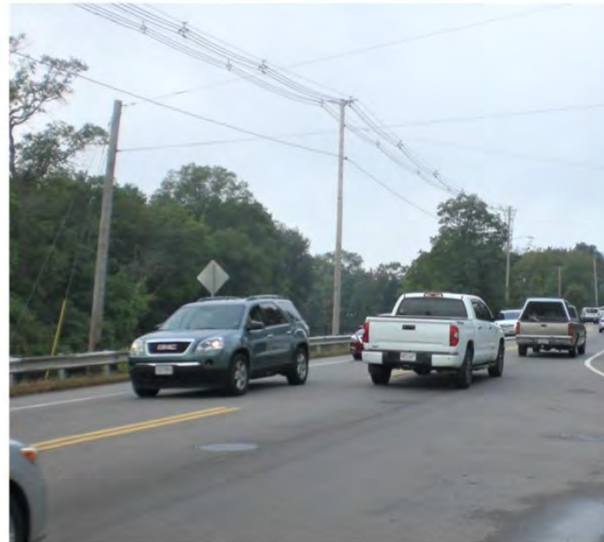
Congestion and Outdated Geometrics