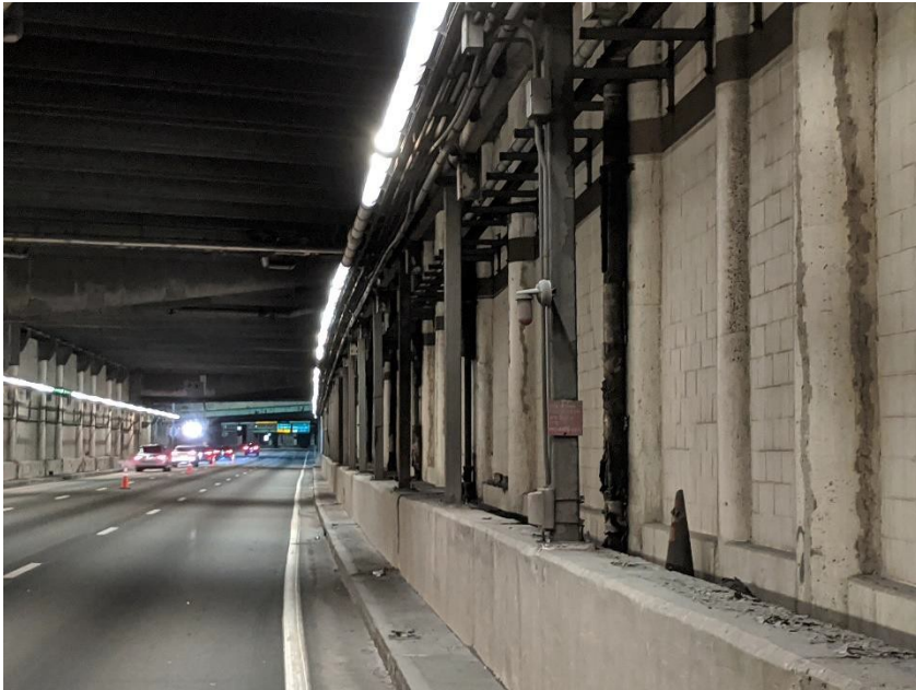
Typ. East Bound Mainline Tunnel with existing light pipe 11/18/2021

The primary purpose of the project is to replace the existing tunnel luminaires in the Prudential Tunnel and Ramps A, B and D as they have passed the end of their useful rated life. The new luminaires will increase safety while incurring significant energy savings. The light fixtures will be fastened to the tunnel walls using a new stainless steel support system.