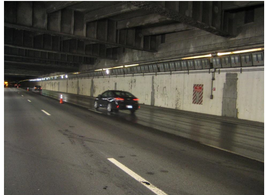
Typ. West Bound Mainline tunnel with existing luminaires