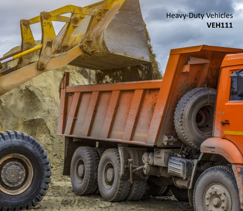
Heavy-Duty Vehicles VEH111