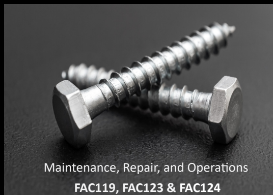
Maintenance, Repair, and Operations FAC119, FAC123 & FAC124