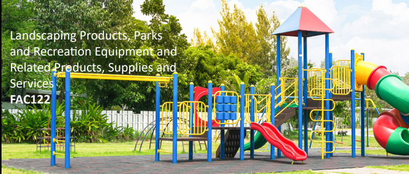
Landscaping Products, Parks and Recreation Equipment and Related Products, Supplies and Services FAC122