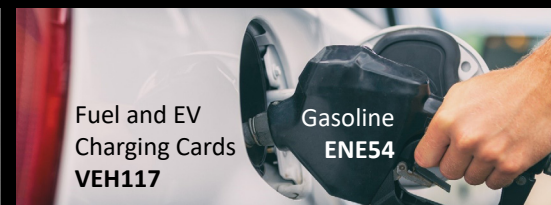
Fuel and EV Charging Cards VEH117