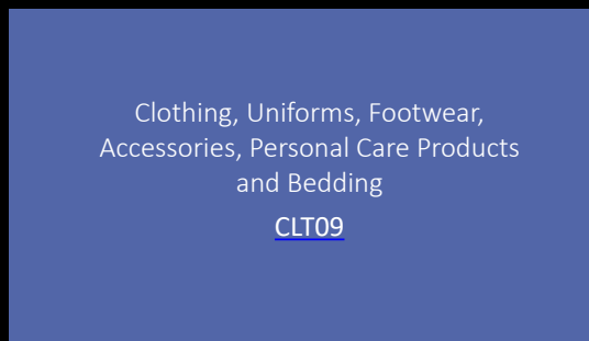
Clothing, Uniforms, Footwear, Accessories, Personal Care Products and Bedding CLT09