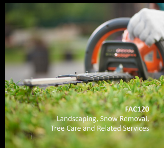
FAC120 Landscaping, Snow Removal, Tree Care and Related Services