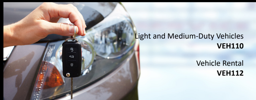
Light and Medium-Duty Vehicles VEH110