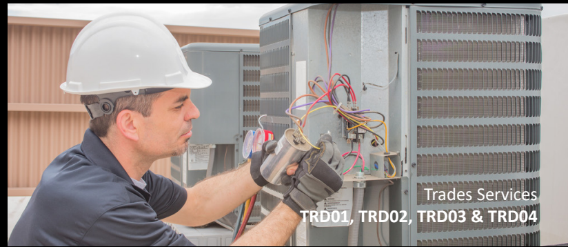
Trades Services TRD01, TRD02, TRD03 & TRD04

Get details at mass.gov/osd > Find a Statewide Contract User Guide