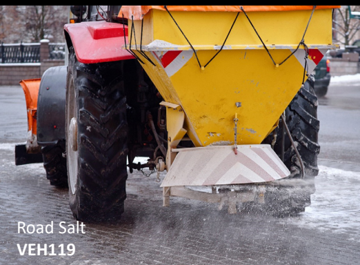
Road Salt VEH119