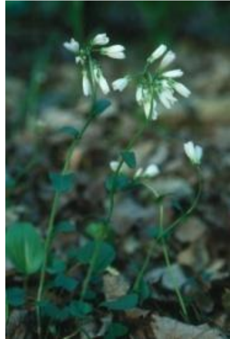
Purple Cress flowering in rich moist woods

DESCRIPTION: Purple Cress is a perennial herb of rich floodplains and low wet woods. A member of the mustard family (Brassicaceae), Purple Cress is a spring ephemeral that gets its name from the green to purplish-green hairy stem and pale purple flowers. The shallow rhizomes are white, but turn green if exposed. Stems are moderately pubescent, slender, and range from 10 to 30 cm (4–12 in.) tall. Basal leaves are heart-shaped or oval and bluntly dentate or undulate with long, slender petioles. The lower stem leaves are similar, but short petioled. The leaves are variable with most having shallow lobes or sinuous margins. The leaves are alternate, up to 5cm (~2 in.) long and 2.5 cm (~1 in.) across, but continue to become shorter and narrower toward the top of the stem. Upper leaves are sessile or slightly clasping. The central stem terminates in a raceme of flowers. Flowers have four regular parts, are approximately 1.25 cm (0.5 in.) across, and are pale purple or purple tinged white. Sepals are green to purple and fade to brown. The siliques (seed pods of the mustard family) are nearly erect. Siliques are approximately 2 cm (~0.75 in.) long, green to purple, and contain a narrow row of very small seeds. The siliques mature and split open to release the seeds by midsummer.