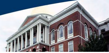
Measures Reviewed by the Taskforce