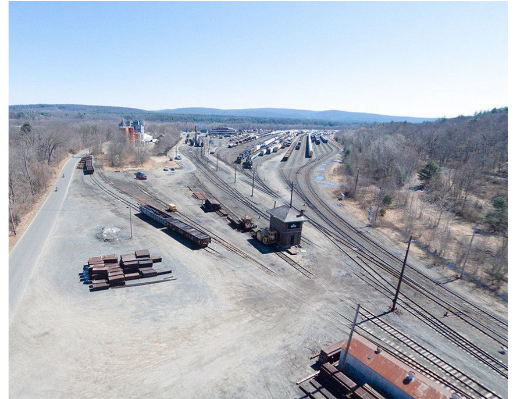
East Deerfield Yard